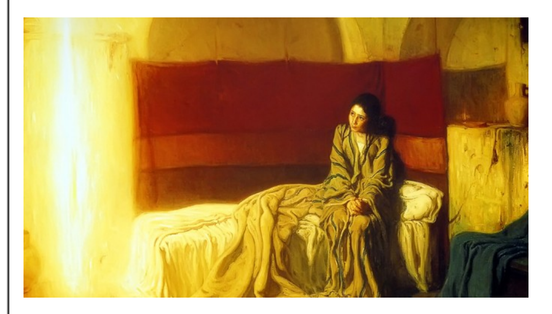
The Annunciation by Henry Ossawa Tanner 1896