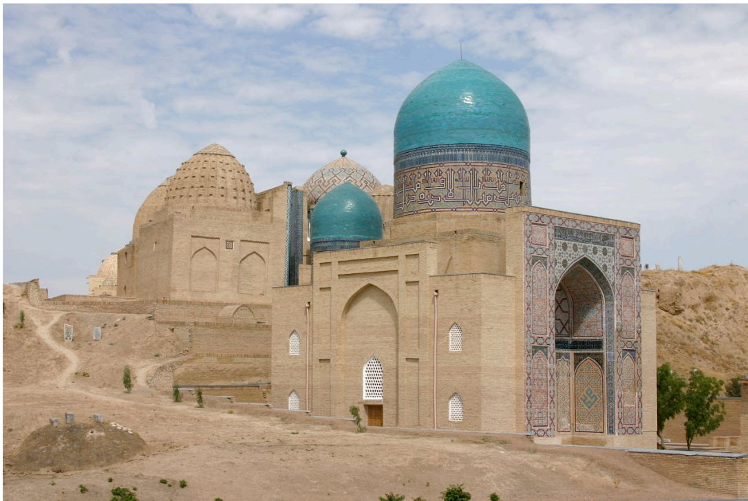
Shah-I Zinda Funerary Complex. Samarkand, Uzbekistan. Late 14 th -15 th century.