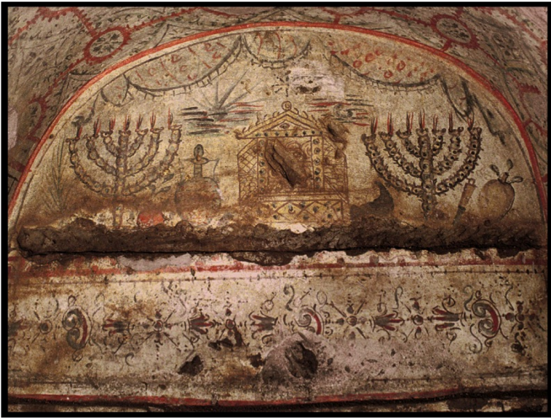
Ark of the Covenant and Menorahs wall painting in a Jewish catacomb, villa Torlonia, Rome 3 rd Century