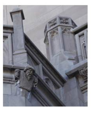
SCOTTISH RITE CATHEDRAL, 1927